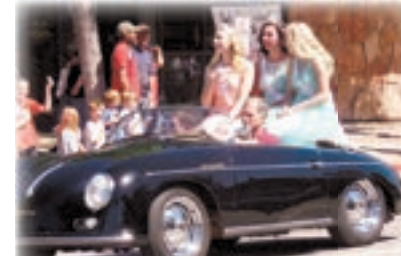
Kanab Cowboy Homecoming Royalty - Page 9