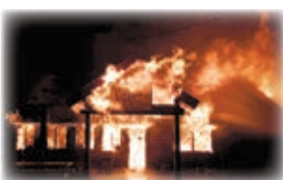
Fire destroys Mama's Pizza and Brew - Page 3