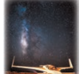
2015 Rutan Fly-in - Page 12