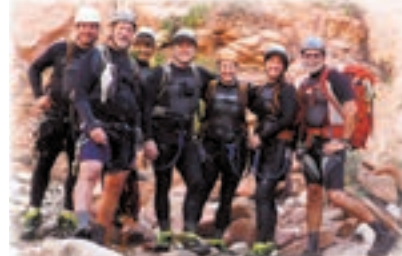
Tribute to Keyhole Canyon hikers - Page 7